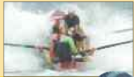
Marathon Challenge at Tathra Sport