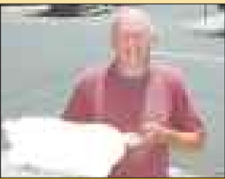
Bonza Bemboka Banquet Page 35