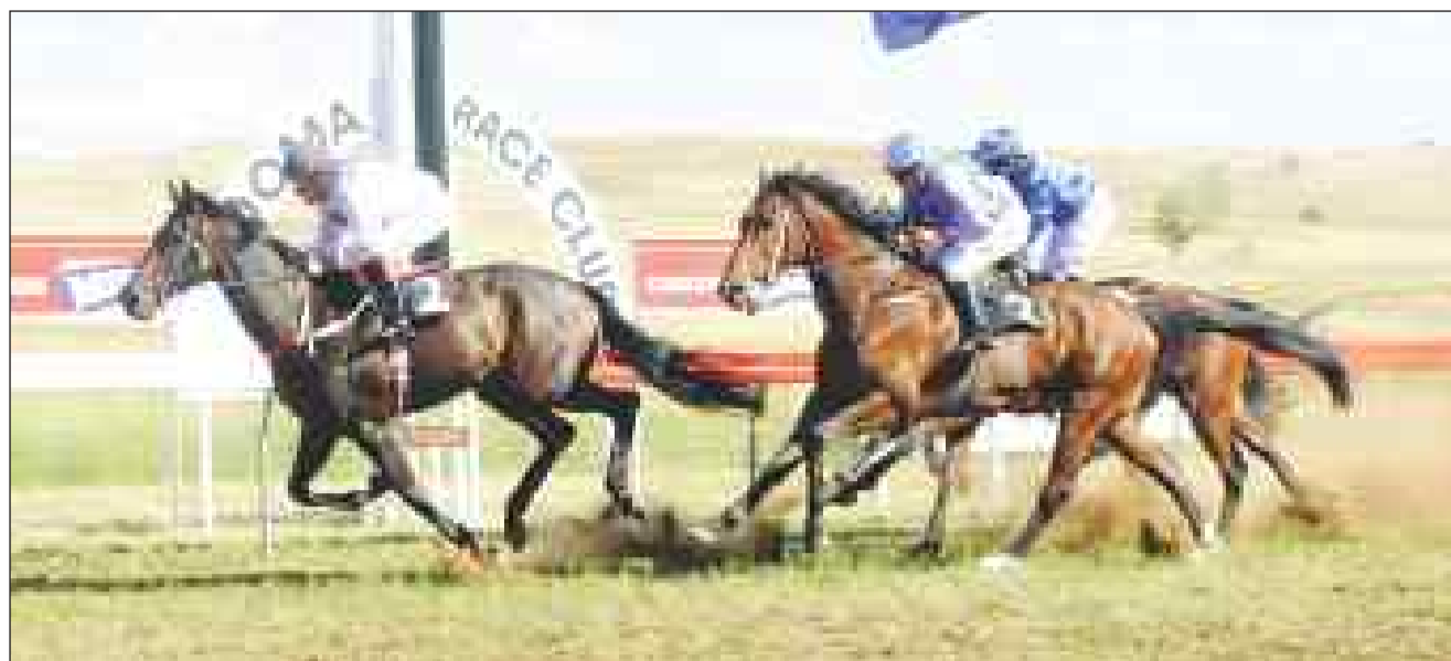
• Local star Sebony stamped himself as the “country cup king” when he added the annual Cooma Cup over 1600 metres to his trophy cabinet on Saturday.