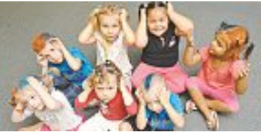
News from the schools.